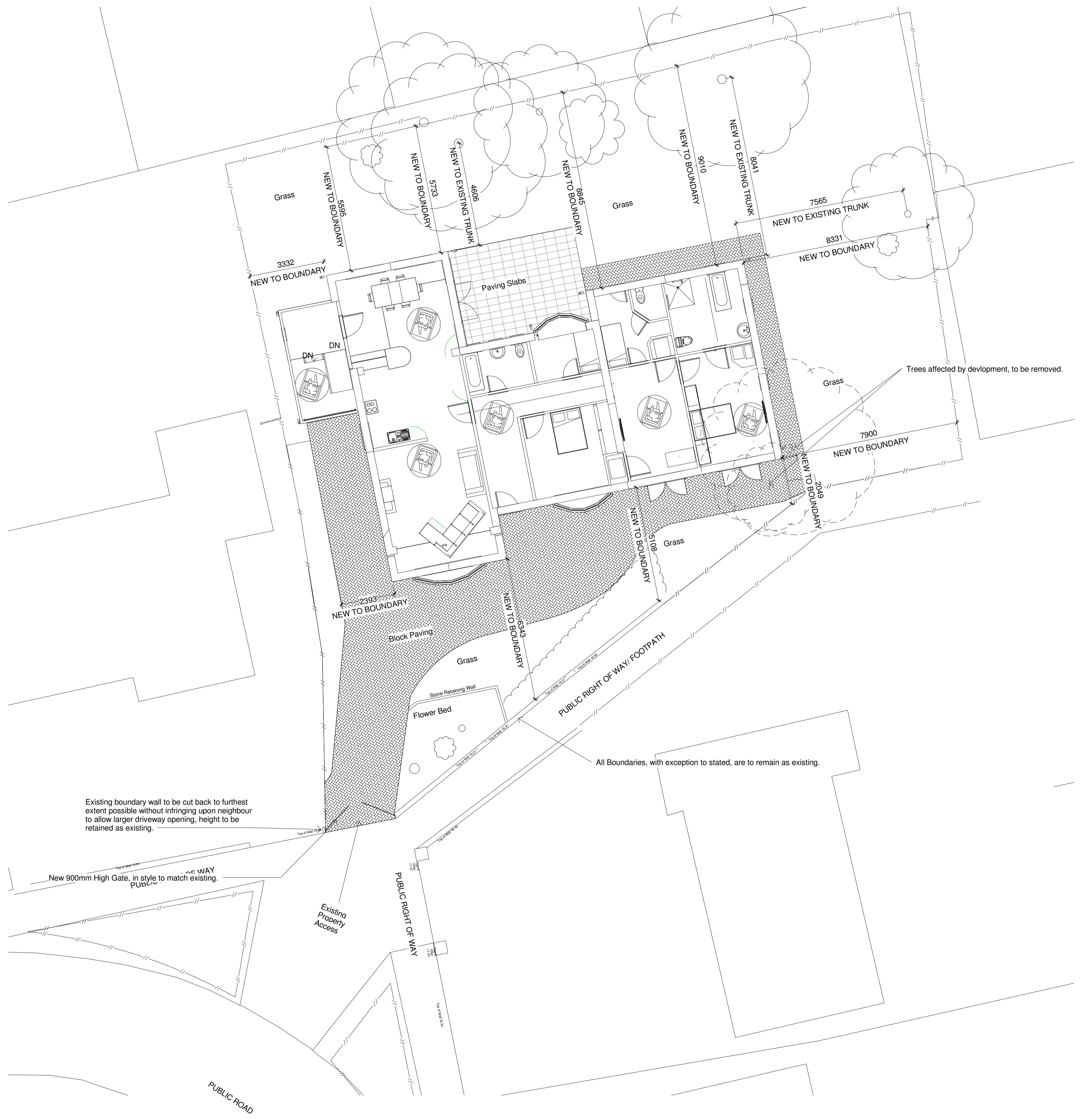
1 L-1 - Site Plan Proposed 1 : 100